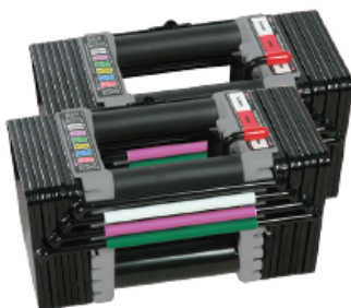
Elite 50 Set

The Elite 70 Set can be further expanded to 90 lbs per hands with the Elite 50 Stage 3 Kit, 70-90 lb.