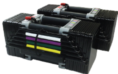
Elite 70 Set

NOTE: The Elite 50 Stage 2 and 3 Expansion Kits will not work with ANY other sets including the Classic 50 Plus or Personal Trainer Set.