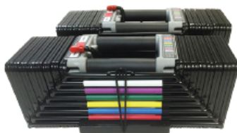
Elite 90 Set