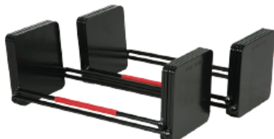
Elite 50 Stage 3 Kit, 70-90 lb